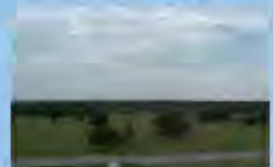
View of Cahokia's Grand Plaza from Menlo Mound