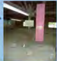
Lifeways Exhibit at Wickliffe Mounds