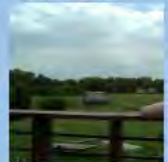
Reconstructed Village at SunWatch