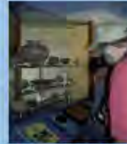
Museum at Angel Mounds

*This rate applies to the SPA member and a guest or to members of ESAF affiliated societies; an additional charge of $50/person will be applied to each guest after the first guest as this field trip is a member benefit. You must be a member of the parent organization, not just of a local chapter. New SPA members will receive the discounted rate on this field trip.