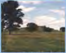
View of Menlo Mound at Cahokia

MARK YOUR CALENDARS FOR JUNE 12-17, 2018