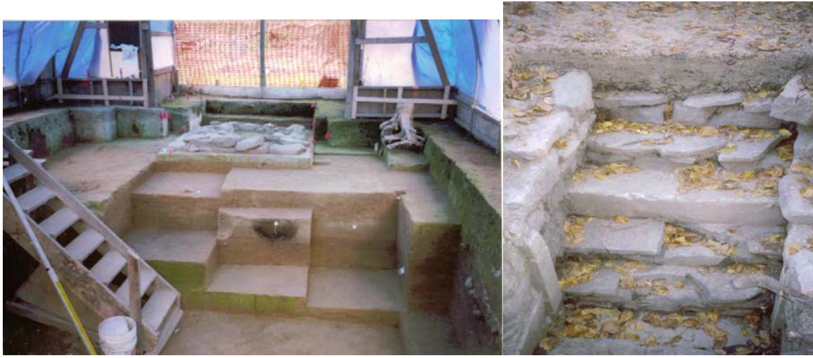
Block 17 EXT. Late Archaic Feature & Historic Foundation

The Conrail Site (36-Lu-169) is continuing on this vital research. We are working on Block 17 EXT. which has produced artifacts from the Middle Woodland to Early Archaic Periods and are constantly up-dating our statistics since the early 1990's in the preparation of an article regarding the Conrail Site. While shovel testing in area near Block 17, we have found a foundation dating to 1840's and earlier. Much more work is needed. We are planning to excavate the entire foundation area. This will be part of our chapter activity in 2009. This firmly places the site in an important early historic/prehistoric reference to its location at the juncture of the Lackawanna River and the Susquehanna River respectively.