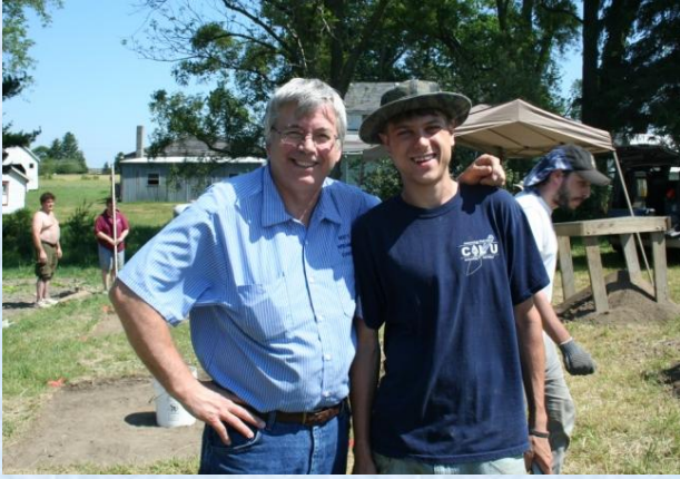
by California University Field School in 2013.