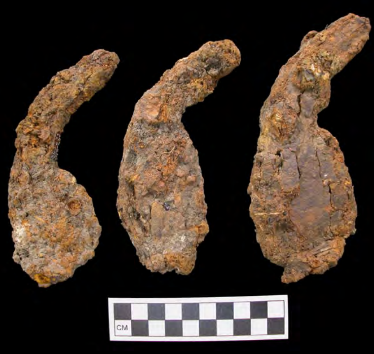
Oxen shoes from the Frazier Brothers Blacksmith Shop Site (36JE73)