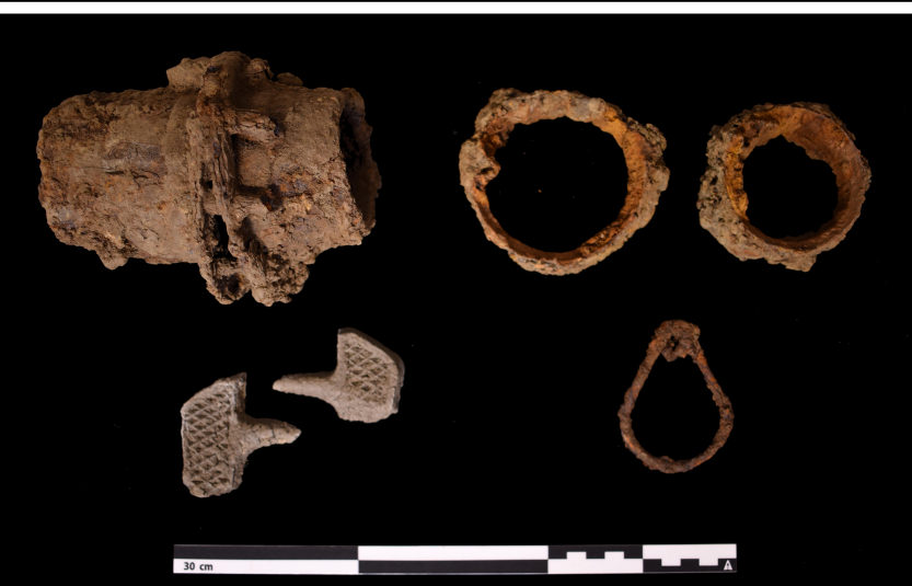
Wagon wheel hub, carriage seat spring coils, rubber pedal or brake pads, and a wire buckle from the McQuilken Blacksmith Shop Site (36IN463)