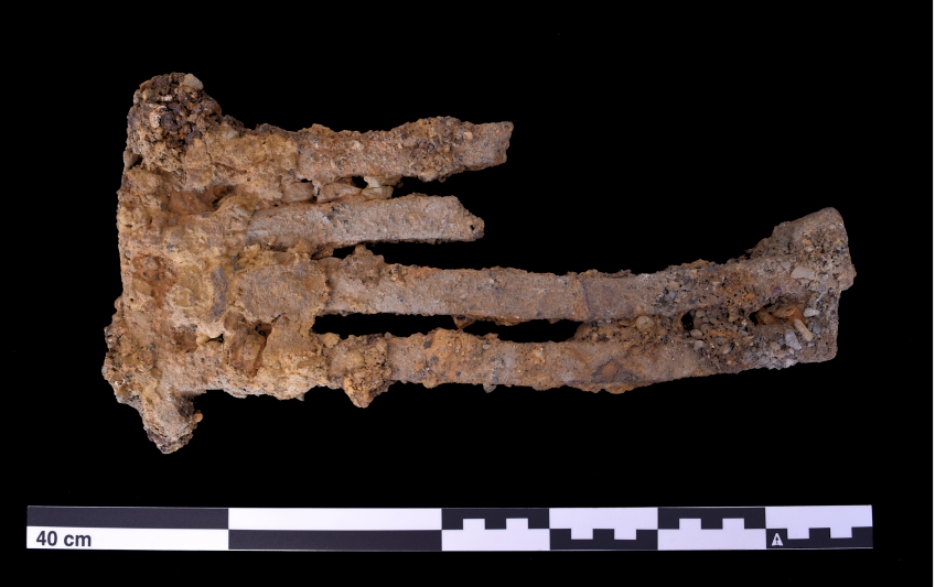
Forge grating from the McQuilken Blacksmith Shop Site (36IN463)