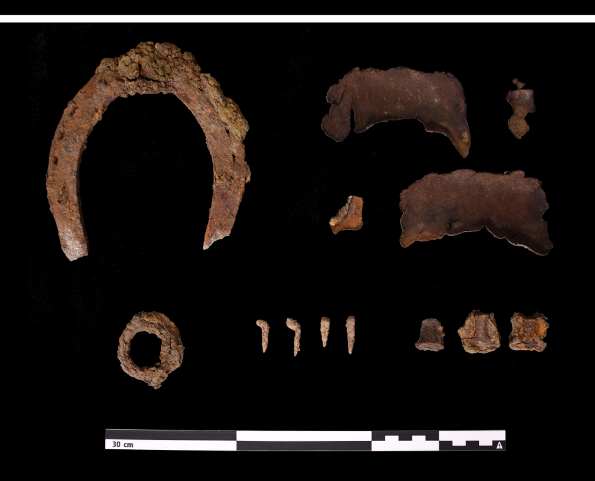
Horseshoe, leather, wrought iron ring, clinched horseshoe nails, horseshoe caulkins from the McQuilken Blacksmith Shop Site (36IN463)