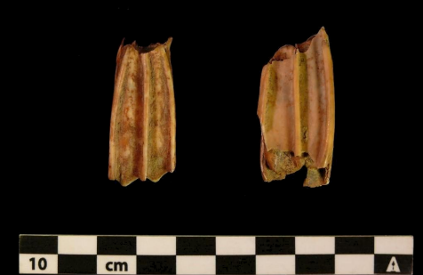
Sheep teeth pulled by a blacksmith from the Millerstown 1 Site (36BL124)