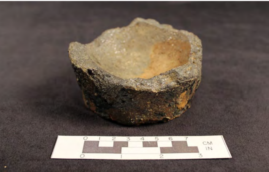
Small crucible for melting metal from the Metropolitan Detention Center Site (36PH91)